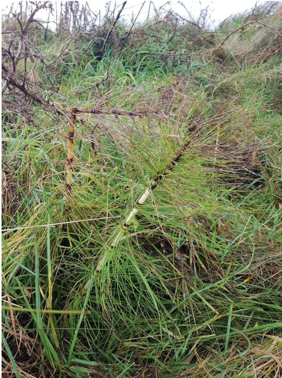
Photo. 1. Equisetum telmateia on the bank at the back of the carpark.