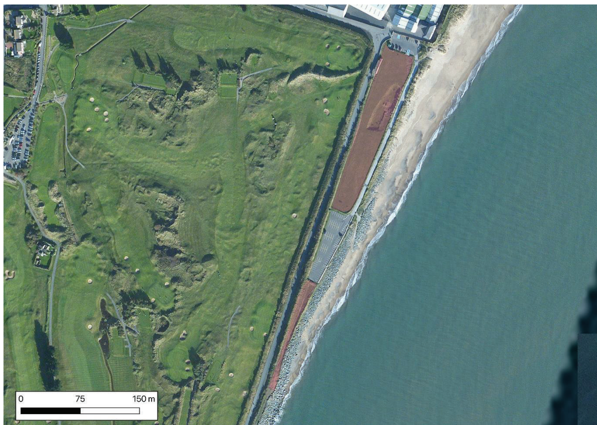
Figure 1. Site Compound 6 at Arklow marked in brown.

One of the areas, Site Compound 6 (SC6) with a total area (ex. car parks) of ca 8,500m 2 , that has been identified as a site at which dredge material from the proposed deepening of the Avoca River upstream of the bridge in Arklow is to be stored for later examination archaeological remains is located to the south of the mouth of the Avoca River (see Figure 1).